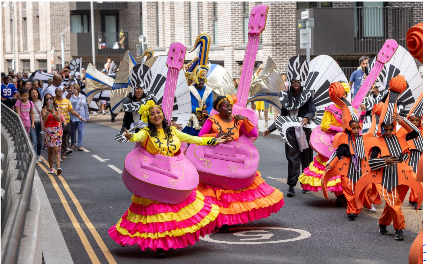
Mahogany Carnival Arts leads a public procession for Wemba's Dream: Join the Journey in Wembley Park

Thank you for your interest in the Royal Philharmonic Orchestra. We really hope we have inspired you to want to develop your career with us, and to helping us towards a vibrant future.