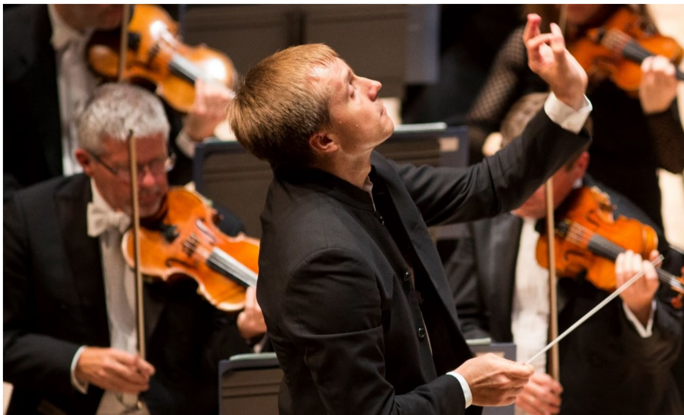
Music Director Vasily Petrenko conducts the RPO at Southbank Centre