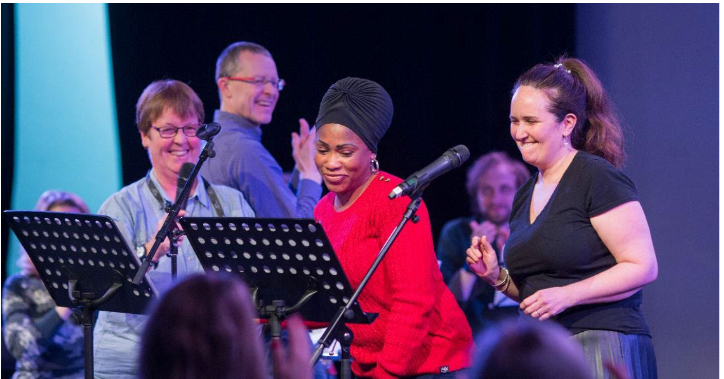
The Lullaby Project

Read our Inclusion and Diversity Policy: rpo.co.uk/inclusion-and-diversity-policy