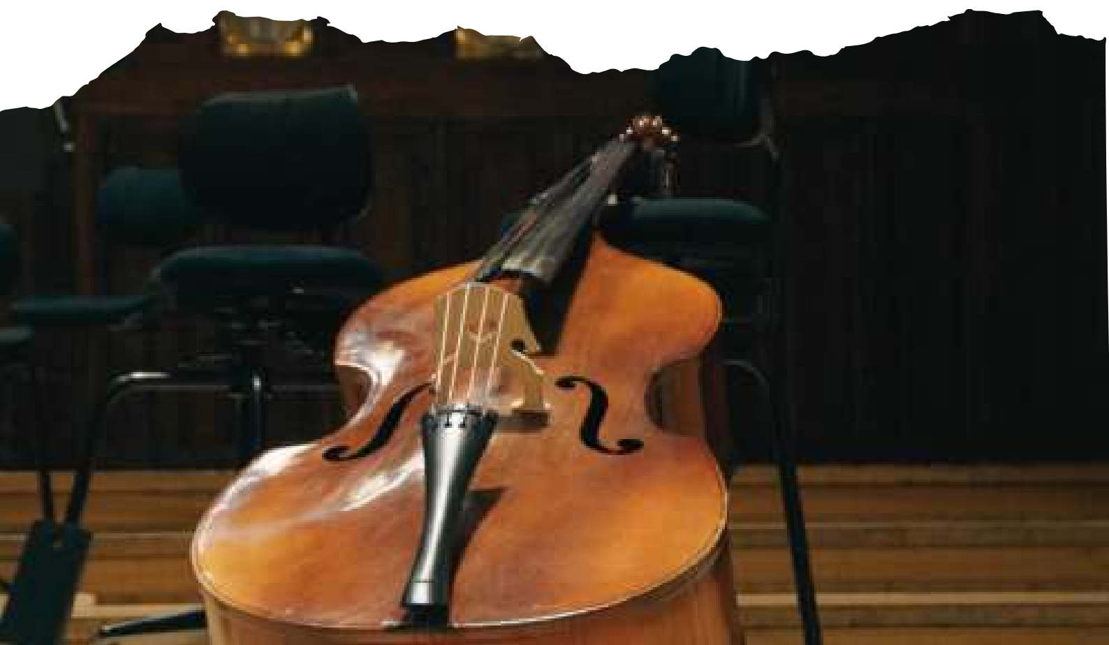
Table 6. Participant labelling scheme