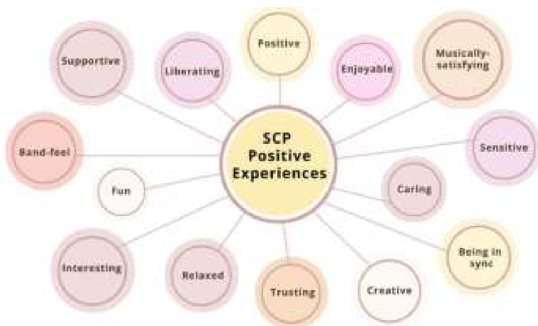
Figure 4. Range of positive experiences for people involved in the SCP

The research team considers the SCP to be an effective music-therapeutic programme because of the reported range of positive experiences for stroke survivors, carers and facilitators alike (see Figure 4).