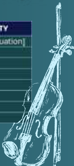
Table 1. STROKESTRA terms, dates, stages and research activity