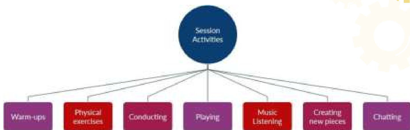
Figure 2: Typical SCP music workshop activities

Practicalities: A number of practical aspects emerged from the facilitators' interviews and the researchers' observations that appeared to be important factors in the effective facilitation of the SCP: