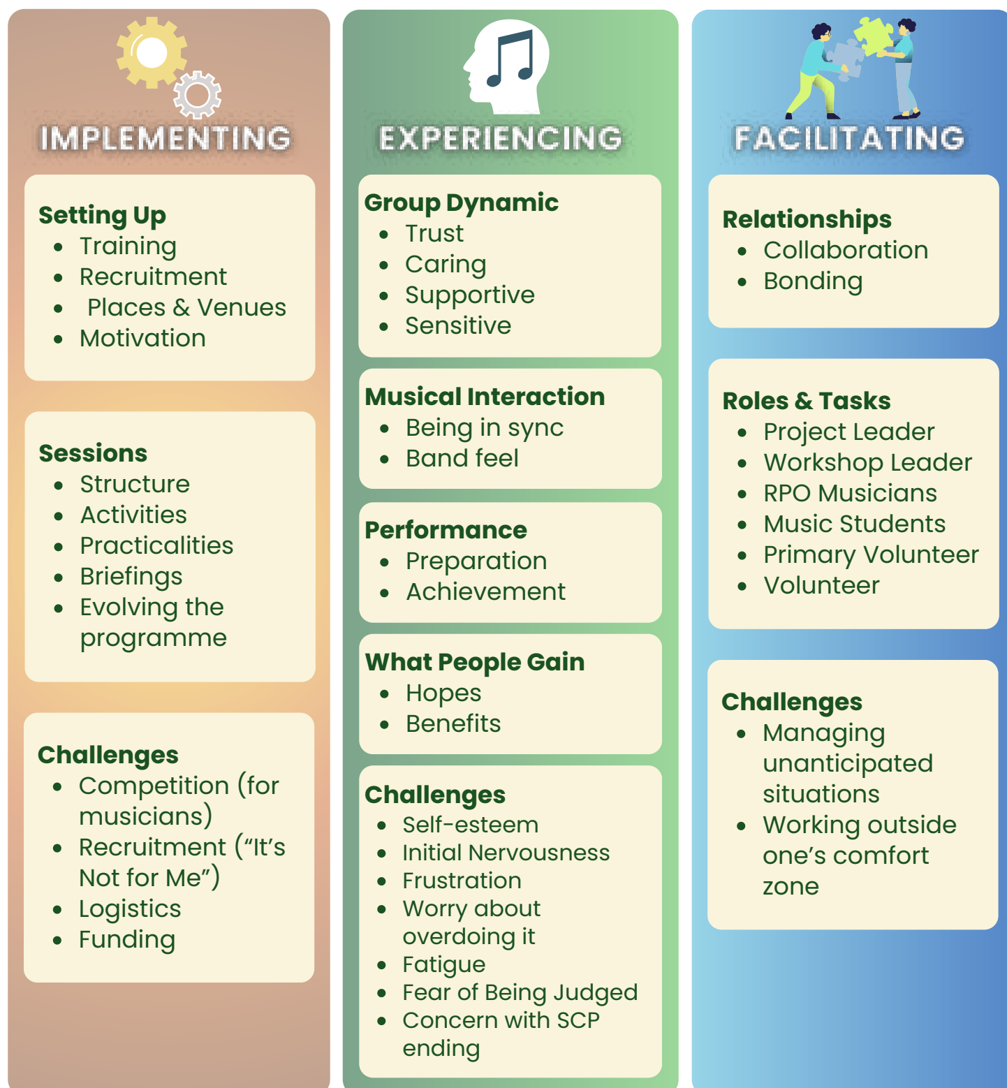
Table 5. Summary of main themes in the SCP data

The key themes arising from the interview data were organised into categories according to the three pathway aims of the project: implementing, experiencing and facilitating (see Table 5).