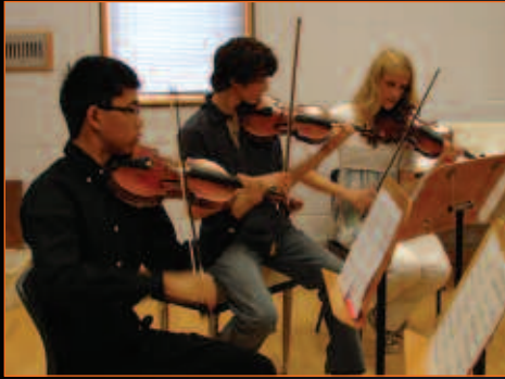
String group coaching session

Coaching Sessions, Family Days and Teacher Training Courses