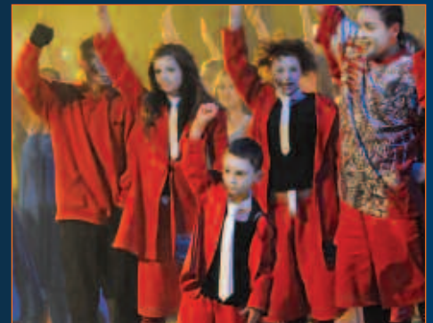
Alchemy II - the final performance

Our programme of work alongside the Orchestra's concert residency in Northampton saw the launch of our series of Family Days at Royal & Derngate (profiled on page 2). RPO resound also continued to support Royal & Derngate's Music Shots programme, coaching young musicians from the Northamptonshire Music Service, and held a teacher training day, following on from our incredibly successful curriculum-led project in Kettering ('Teachers