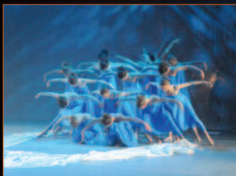
Alchemy II - the final performance

We've had a fantastically varied time at RPO resound over the past few winter months. The beginning of November saw RPO resound embark on a relationship with Orchestra Europa, continuing success with our Ismaili ensemble project and the conclusion to our music and dance extravaganza in Brentwood, Alchemy II . The performance of Alchemy II proved itself to be a wonderful evening, with hundreds of young people dancing and performing at the Brentwood Centre to a capacity audience. All the performers involved should be incredibly proud of what they have achieved. The relationship with Brentwood continues to grow, working with different groups of young people each time – we are really looking forward to seeing what the next incarnation of the project will be!