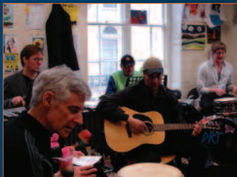
Participants at The Connection

Working with the homeless at St Martin-in-the-Fields